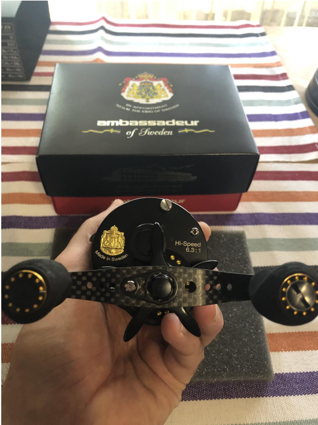
The carbon fibre handle gives it a space age look and the Swedish Crest sits proudly on the right side plate with the inscription Made in Sweden .