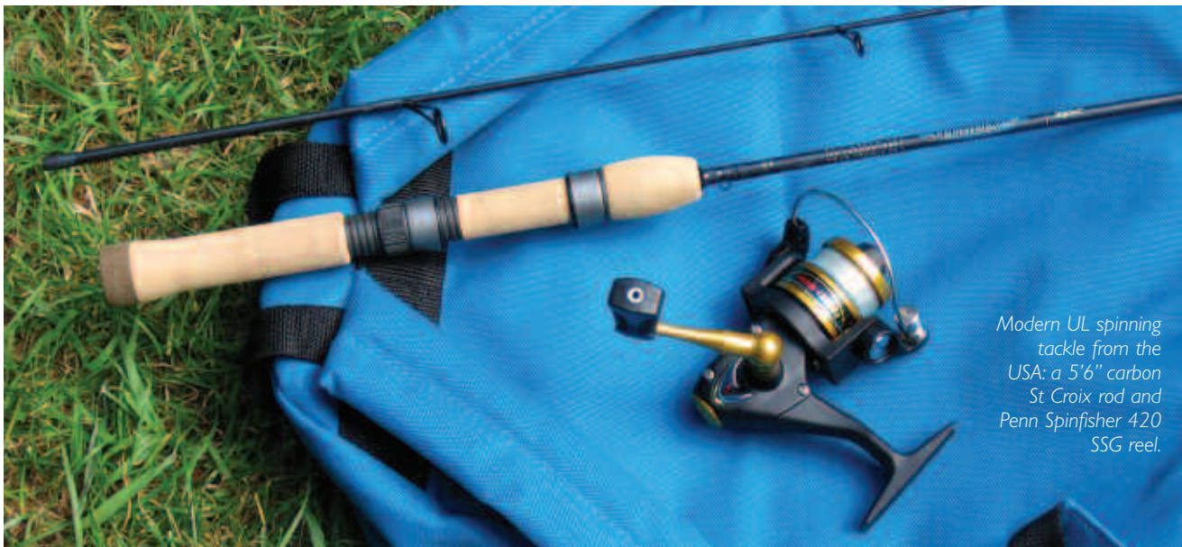
Modern UL spinning tackle from the USA: a 5'6" carbon St Croix rod and Penn Spinfisher 420 SSG reel.