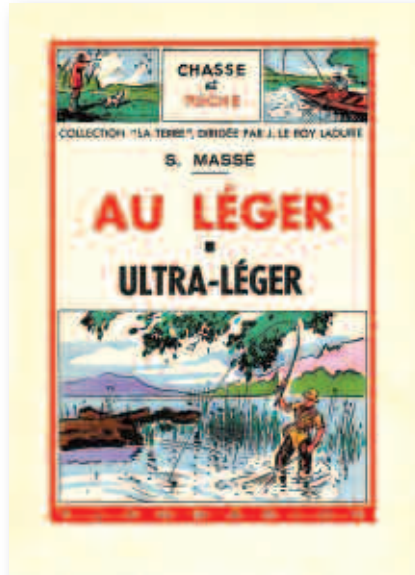
Silvain Massé, Au léger - ultra-léger (1946).

Different countries have different definitions of what an UL spinning rod is, and each definition is nothing more than an arbitrary choice - as definitions often are. In the Netherlands, where I'm from, we have a long-standing tradition with UL spinning. Here an UL spinning rod is considered to have a maximum casting weight of 6 grammes or less (6 grammes being slightly less than 1/4 oz). In the USA the