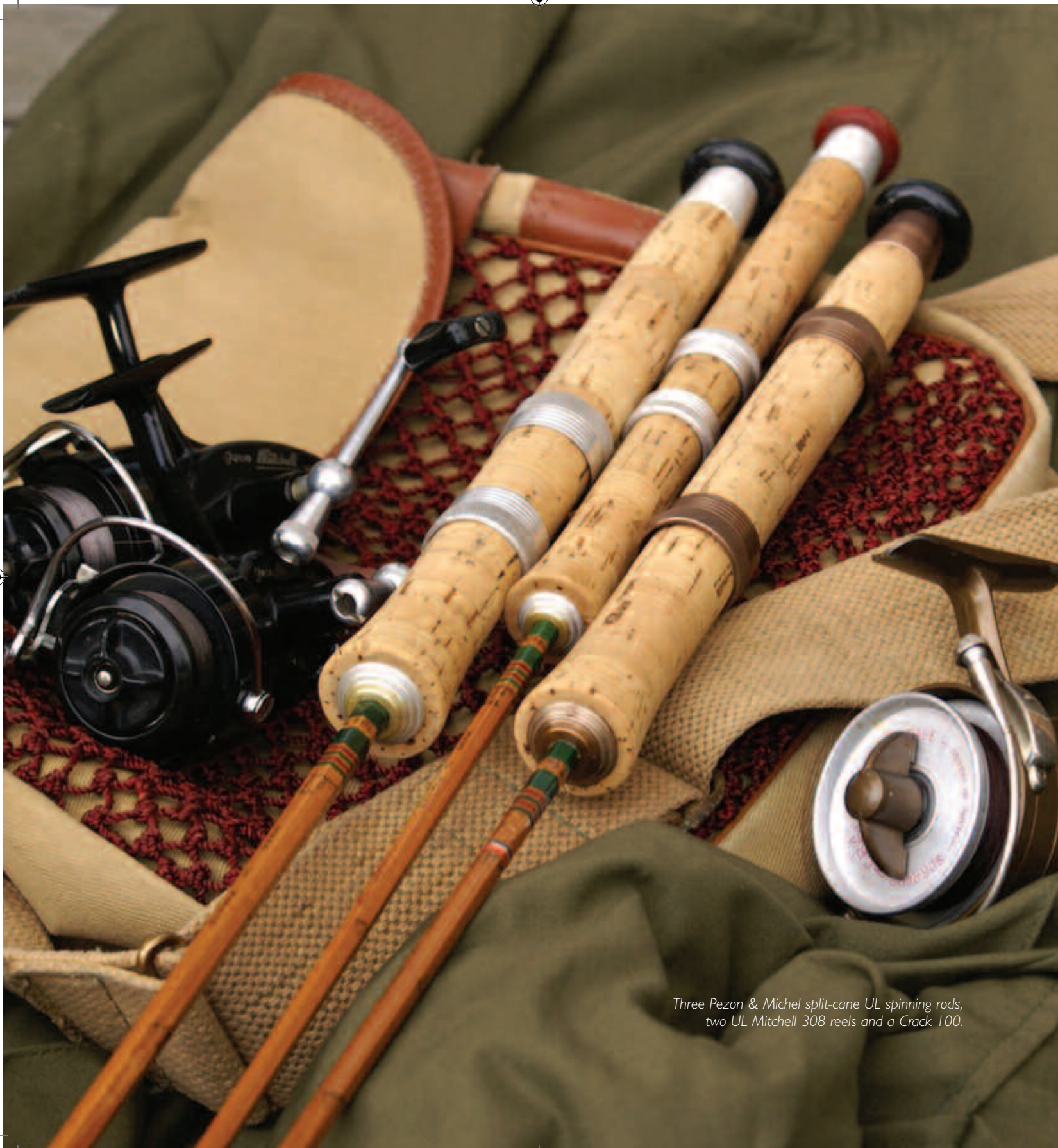
Three Pezon & Michel split-cane UL spinning rods, two UL Mitchell 308 reels and a Crack 100.