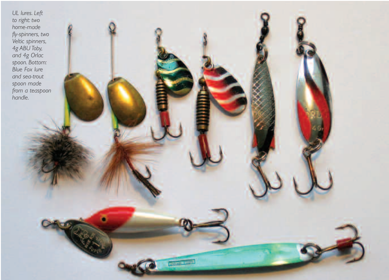
UL lures. Left to right: two home-made fly-spinners, two Veltic spinners, 4g ABU Toby, and 4g Orlac spoon. Bottom: Blue Fox lure and sea-trout spoon made from a teaspoon handle.

Although UL spinning may not be a technique favoured by a large group of British anglers, it does have its history in the UK. The French were quite aware of