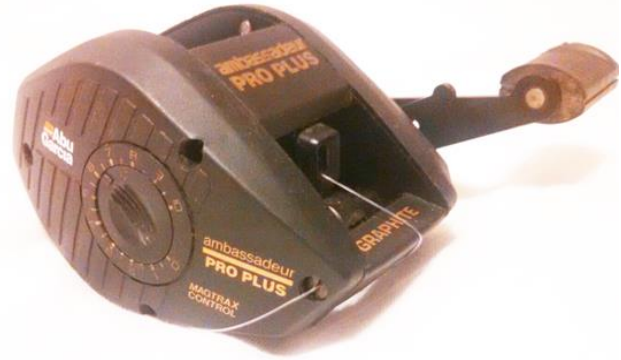
Ambassadeur Pro Plus