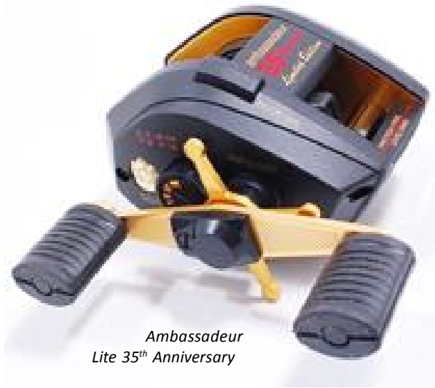
Ambassadeur Lite 35 th Anniversary