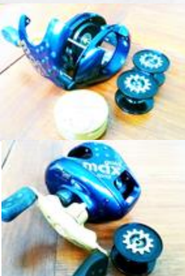
Rare blue Gold Max

Concept 2000 reels can be seen as ABU's follow up on the XLTs. Functionality and ergonomics were given high priorities and Austrian Achim Storz gave them an innovative shape. Pro Max, top model in the range, came with automatic 2-speed retrieve, 6 stainless steel bearings, Automag self-adjusting spool control, Camlock quick change spool, Fast Cast thumb bar, flipping switch and flip up hood. 2 sizes were available, Pro Max 1 – same size as the 521/XLT 1, and Pro Max 2 – same size as the 522/XLT 2. 1992 was the year ABU introduced their MATRIX, basically a system similar to «balanced tackle» a long used approach by ABU since the 40's to optimally matching rod and reel and suggesting the suitable rod to each reel model. The MAX reels, ABU's family name for the Concept 2000 reels, were listed in the MATRIX as: