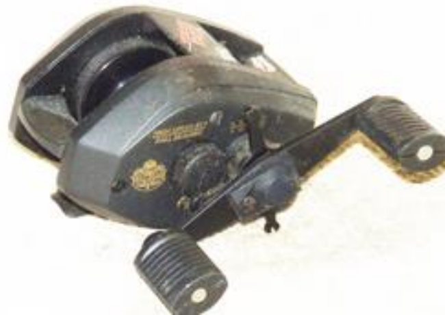
Ambassadeur Ultra Max