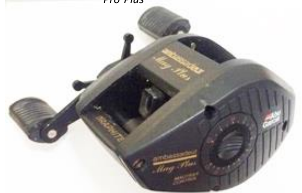
Ambassadeur Mag Plus