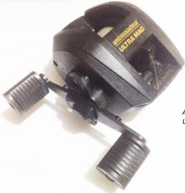
Ambassadeur Ultra Mag