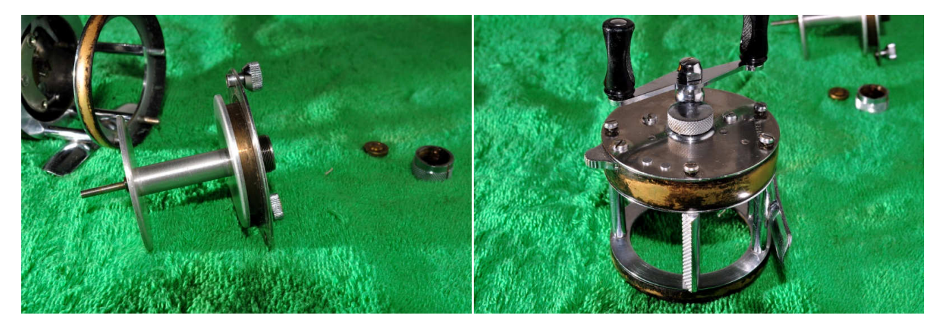
The spool was stuck firm. As this is a display reel the spool was left as is-it worked fine and removal may have caused some damage to the reel. In this instance a couple of drops of oil were added to the bearing and the spool cap was replaced.

Remove the four pillar screws on the right side plate.