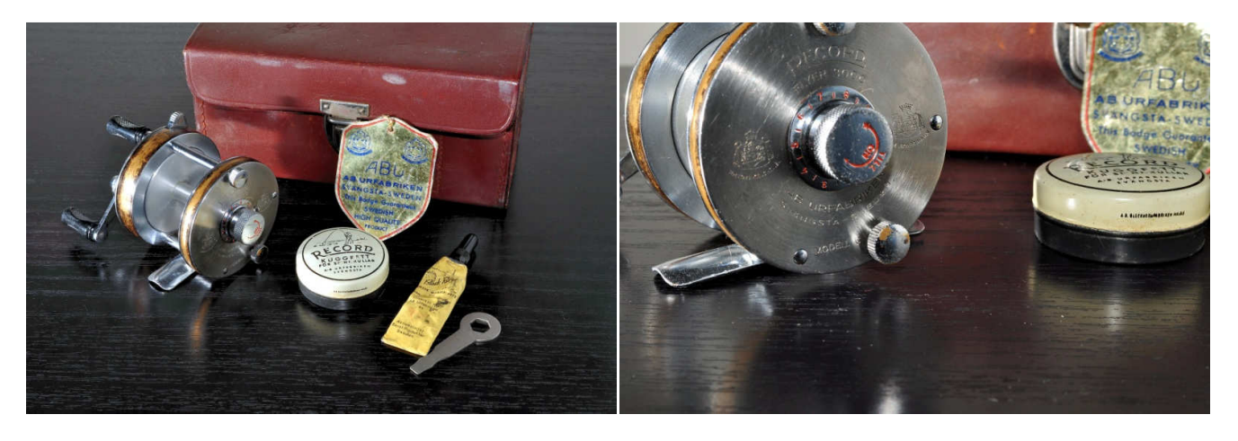
This beautiful little reel came with all the original accessories and I would assume is very collectable. Note the 'Modell C' designation next to the lower thumb nut on the left hand side plate.