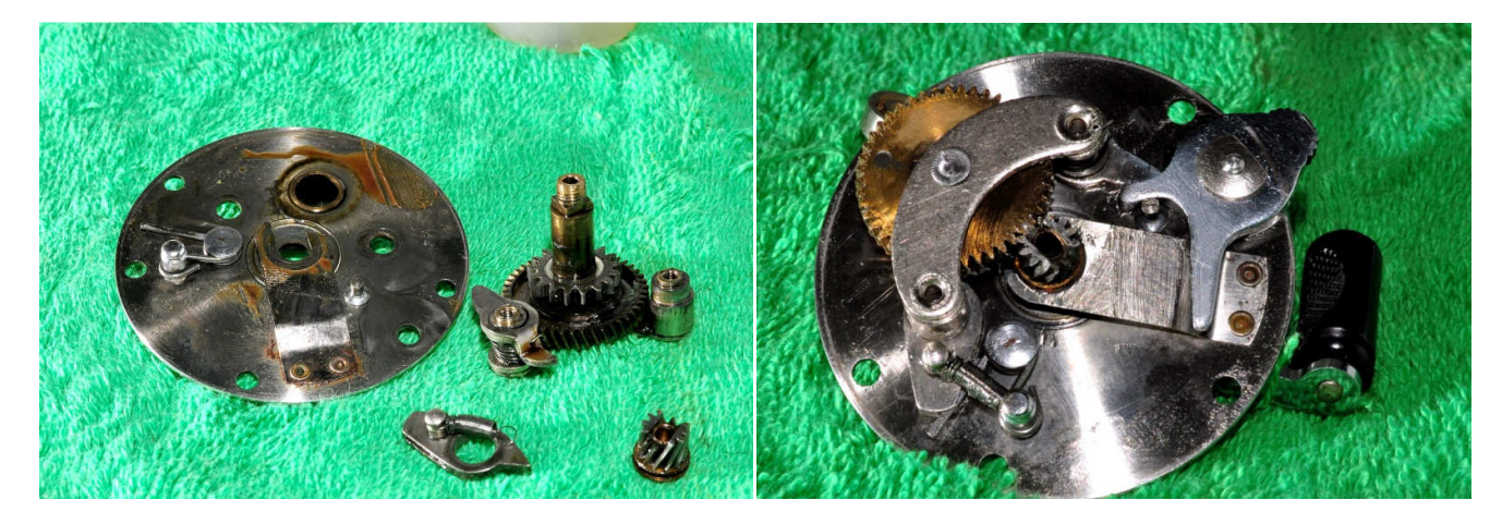
You can now remove the whole gear bridge assembly and the pinion gear. Give everything a thorough clean before reassembly.

Turn the side plate over and remove the two bridge screws.