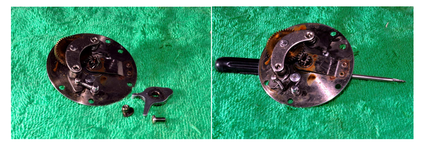
Remove the screw and nut holding on the free spool lever. Remove the spring for the 'anti reverse' dog from the post on the side plate.

Give the bearing a good clean in lighter fuel and when it is completely dry add a drop of oil.