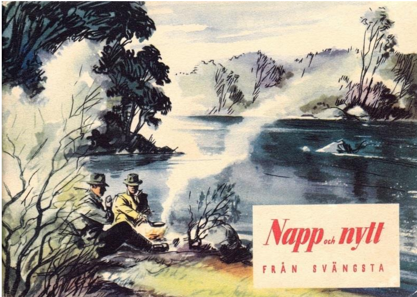
Napp och nytt 1948 The fishing in the river Mörrum