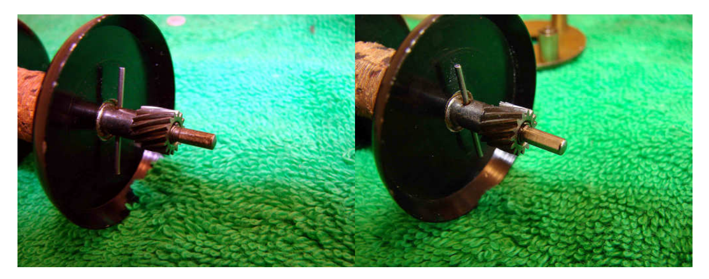
As will the drive gear side. Second photo shows corrosion removed. If you use a metal polish make sure to wash the part thoroughly to remove any trace of the polish. Note that there are no brake blocks present.