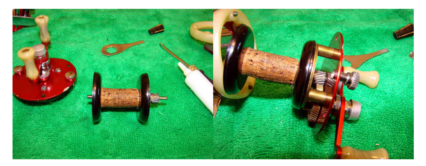
Add a drop of oil to both ends of the spool shaft and then replace the spool in the right side plate. The spool and side plate can then be replaced in the frame. Tighten the two thumb nuts.