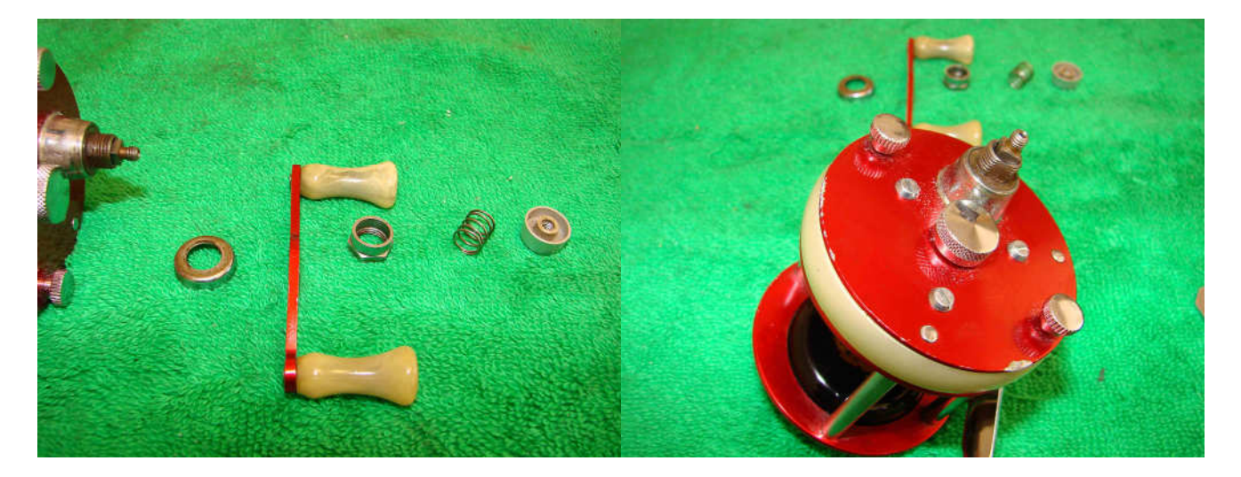
Remove the dust shield. Everything is laid out in sequence. Unscrew the two thumbnuts on the right plate.