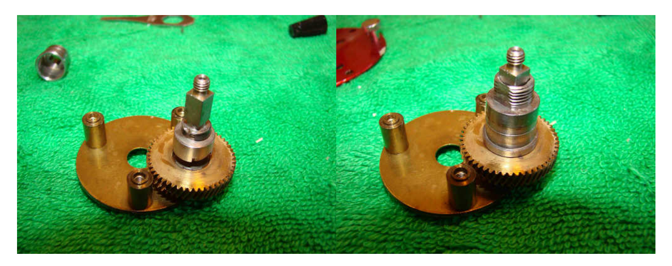
Replace the main gear on the drive shaft followed by the lock pin retainer and the handle bearing. Lubricate the handle bearing with liquid grease or heavy oil.