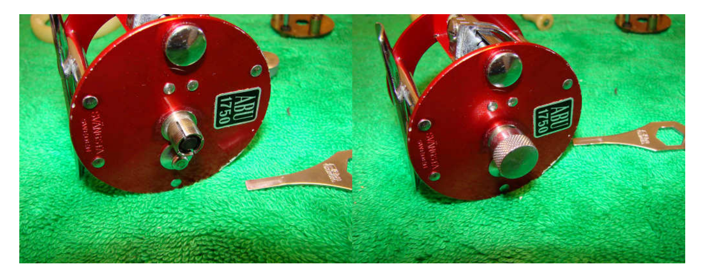
Add a drop of oil to the spool bearing and replace in the left side plate. Replace the left spool cap.

Add a drop of oil to either side of the worm gear. Make sure that it soaks in past the plastic bushing. Replace the worm gear and the line carriage in the frame. Replace the pawl and the line carriage screw. The line carriage sits on the worm gear so smear oil/liquid grease on the entire worm gear and not just in the grooves.