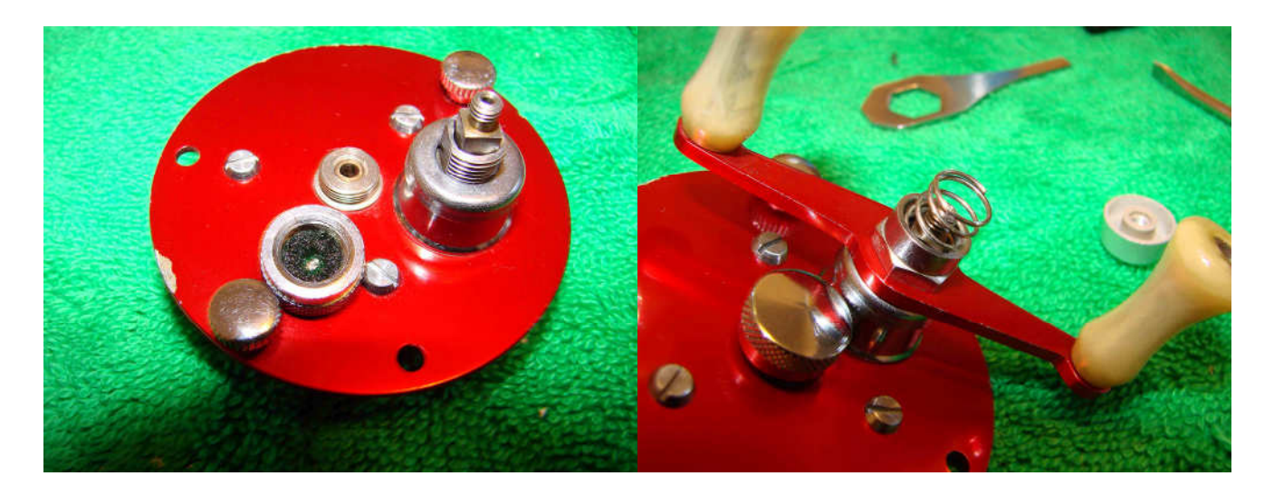
Replace the felt washer in the right spool cap and add a few drops of oil to it. Add a drop of oil to the bushing in the side plate before replacing the spool cap. Replace the dust shield followed by the handle. Replace the free spool spring and the free spool button.