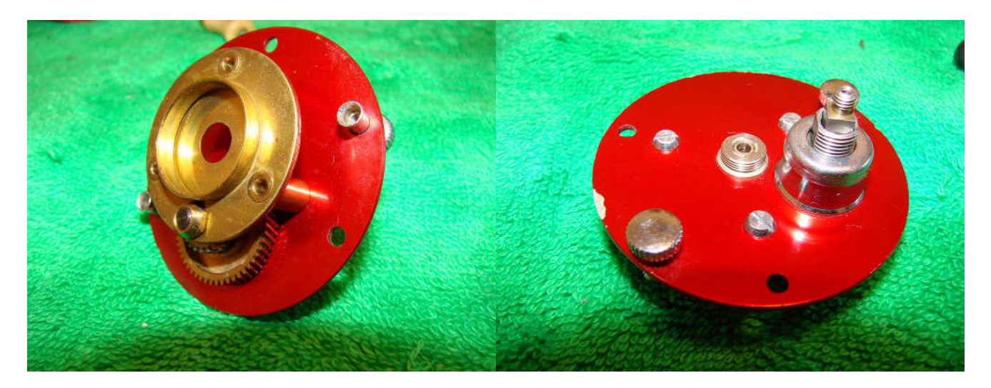
Replace the bridge gear unit on the side plate and fix in place with the three bridge screws. Replace the dust shield.