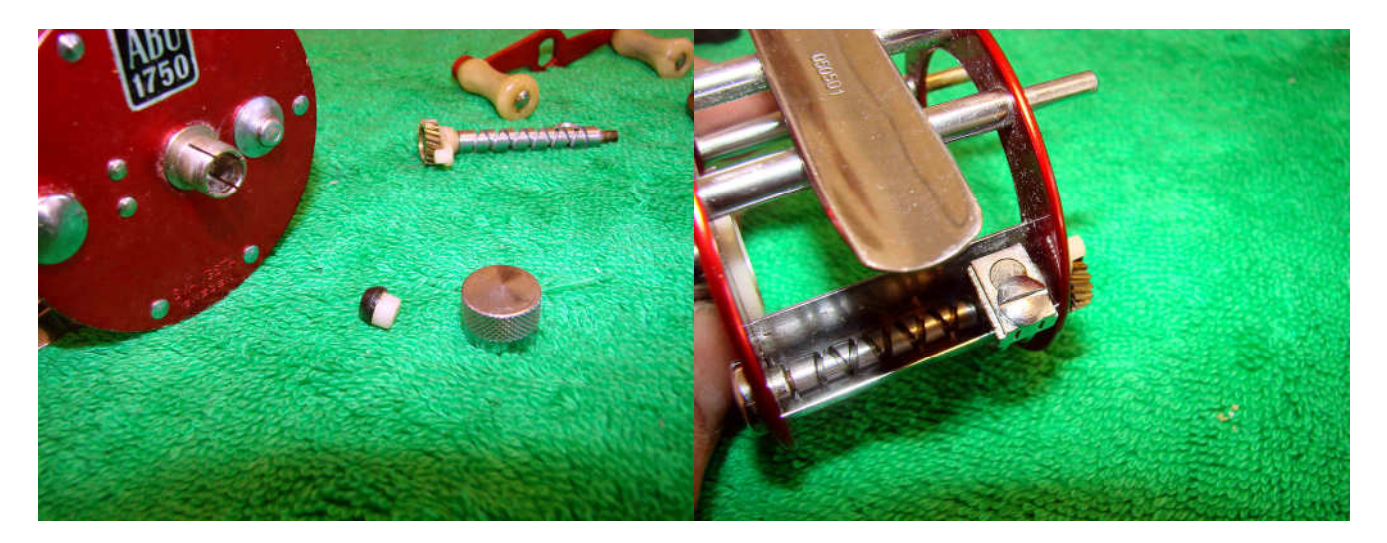
And remove the spool bearing. Remove the level wind assembly from the frame by undoing the line carriage screw and removing the pawl. The worm gear can then be removed from the line carriage.