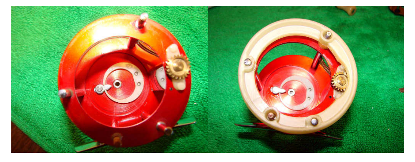
Add a drop of liquid grease to the clicker assembly. Move the clicker side to side to make sure it is worked in properly. Replace the head ring (plate spacer).