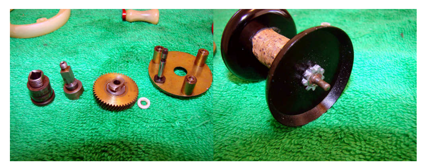
Followed by the drive gear and gear shaft bearing (white plastic washer). The spool shaft on the clicker side shows corrosion and will need to be cleaned up.