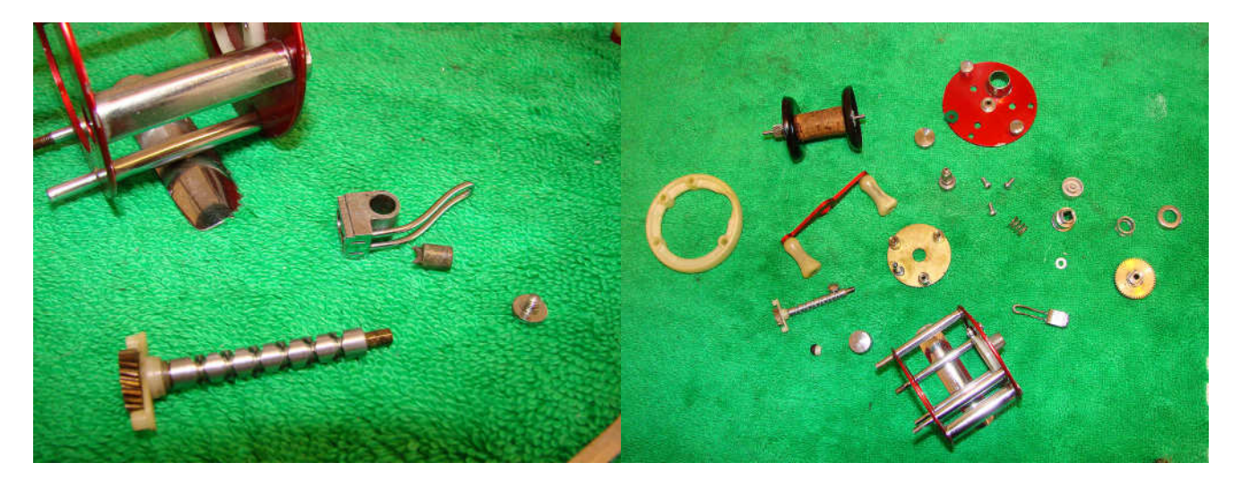
Worm gear (foreground), line carriage next to pawl and line carriage screw to the right of the photo. Everything is now ready for a thorough clean before reassembly. I prefer not to use harsh cleaners on older reels. A clean using warm water and washing up liquid followed by a thorough rinse should be sufficient.