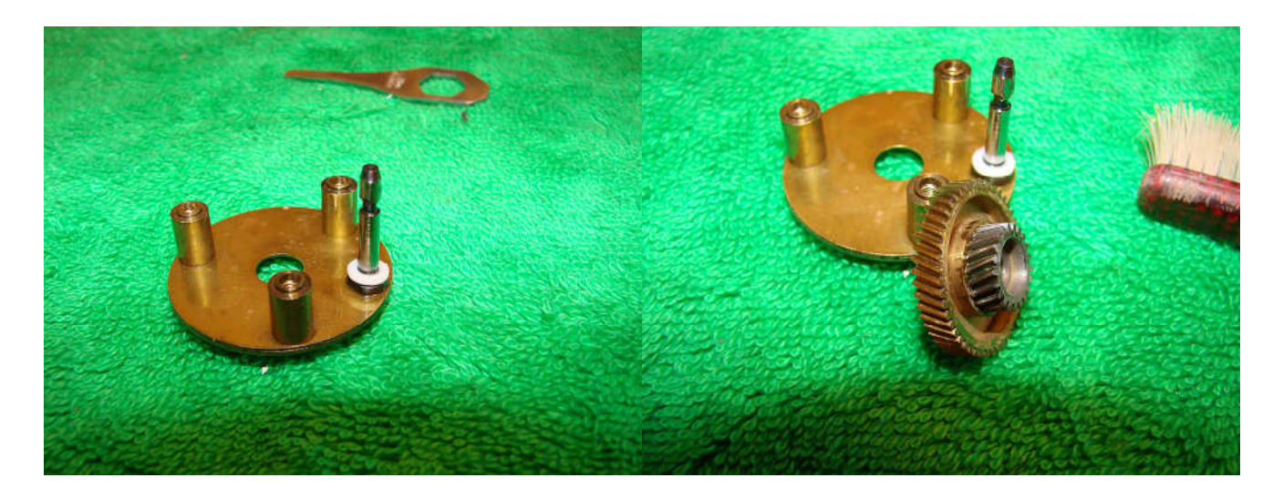
Add a drop of oil to the drive shaft and replace the drive shaft bearing (plastic washer). At this stage it is easier to add grease to the teeth on the main gear. I have used a light liquid grease.