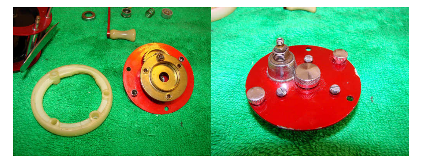
Remove the whole side plate and head ring (plate spacer). Remove the three bridge screws.