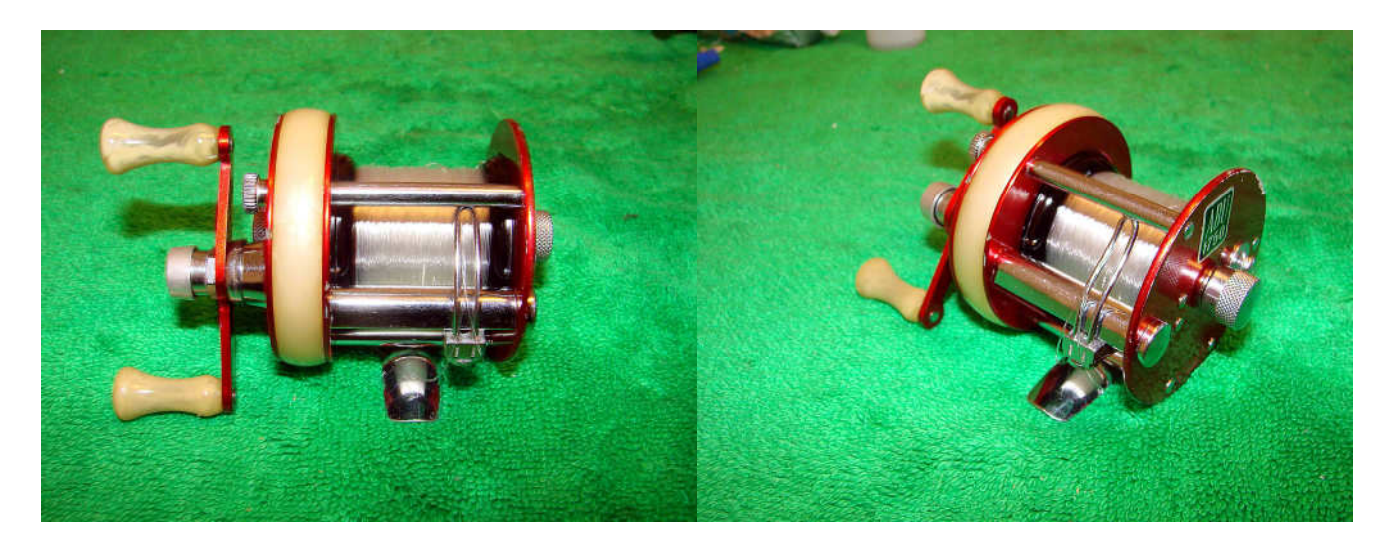
Fill the spool with line and you're all ready to go fishing!