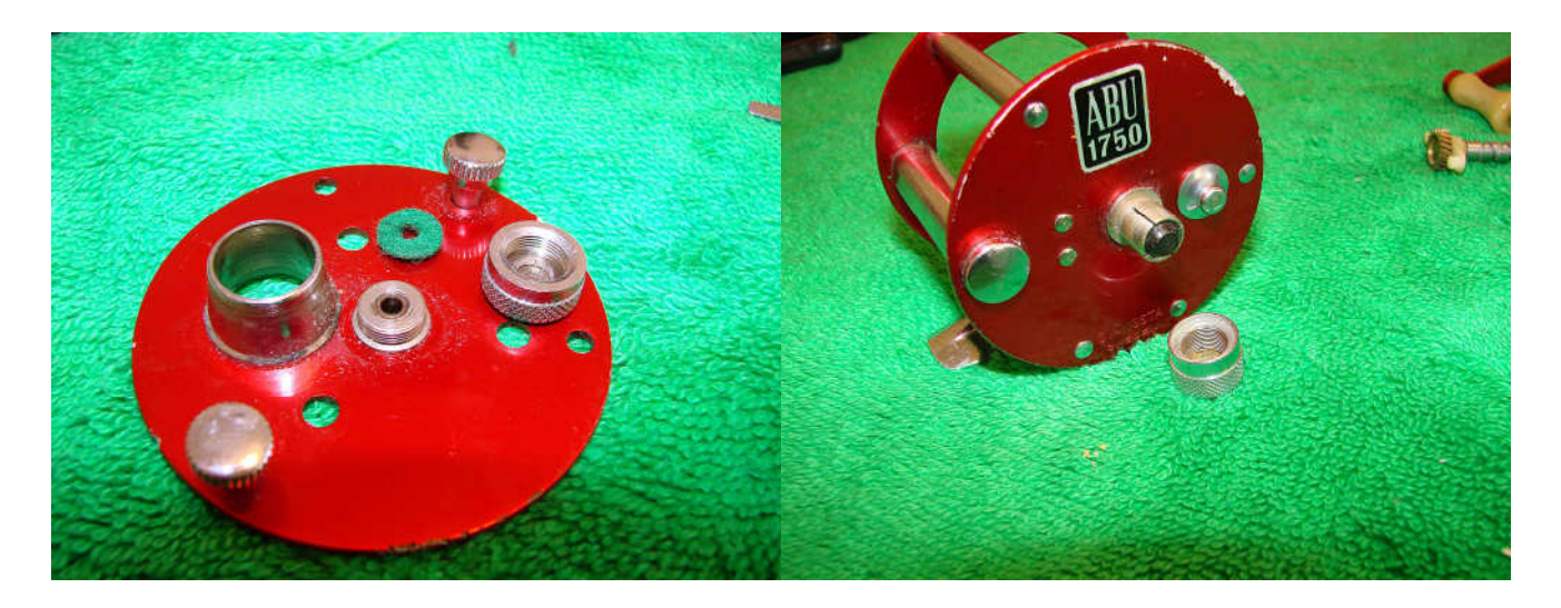
Remove the right spool cap and pry out the felt washer with a toothpick. This can be cleaned by soaking in lighter fluid. Remove the left spool cap.