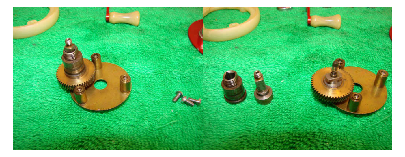
Remove the entire gear bridge unit from the other side of the side plate. The handle bearing and lock pin retainer can then be removed.