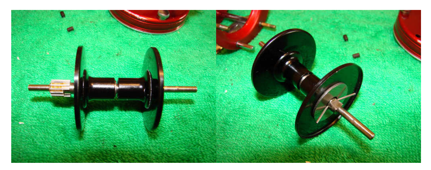
It must have been a huge amount of force to cause the spool to separate and bend the brake pins (judging by the force required to get them back together). I have no idea what could have caused it.