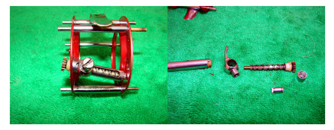
Remove the line carriage nut and pawl and then the carriage screw and cover can be removed from the side of the frame.