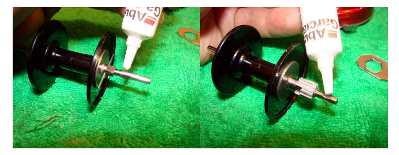
Add oil to the spool shaft on both the left and right hand side of the spool.