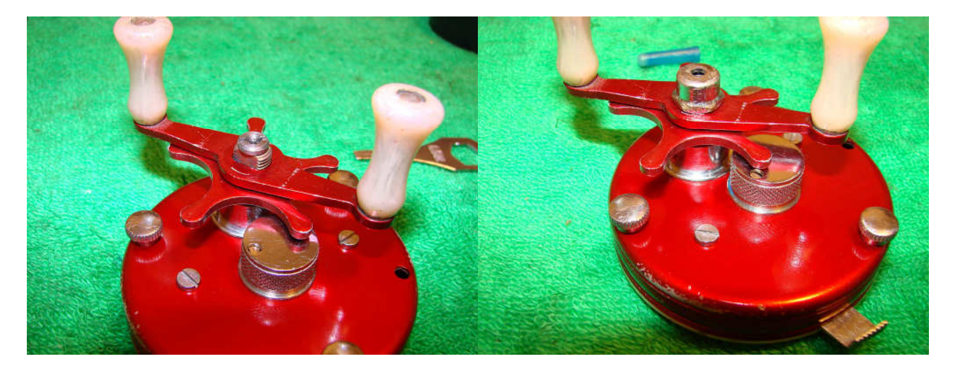
Replace the handle and drive shaft screw followed by the handle nut. Make sure it is snug as there is no handle nut lock on these older Ambassadeurs.