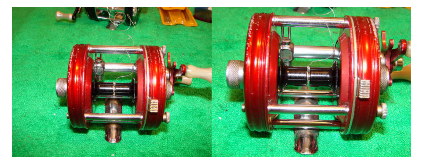
I decided to strip the line off the spool to see if I could find any clues as to what was happening....then I found this. I have never seen anything like it. It looks as if the spool has been forced apart in the middle.