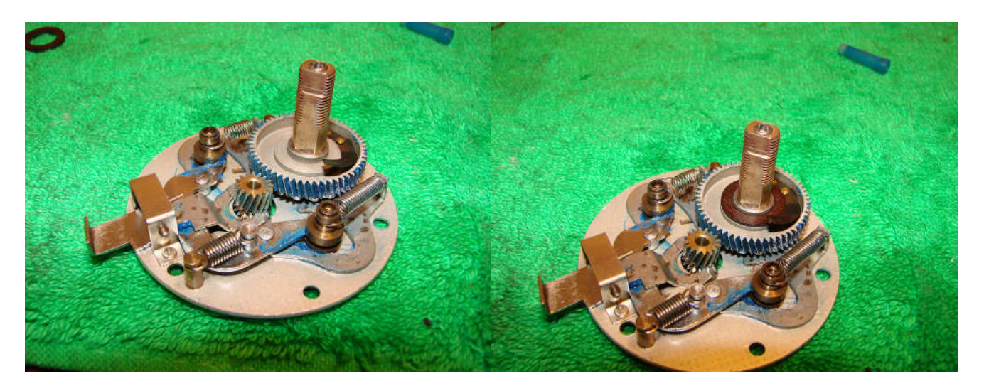
Replace the main gear and the pinion gear. Apply grease to the gears ensuring that it reaches the base of the gear teeth. A small paint brush is useful for ensuring even coverage. Replace the top drag washer-I found that if this is greased it can make the drag jerky-as such leave it dry.