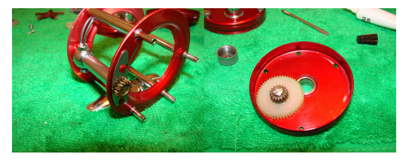
Replace the carriage screw lock, the pawl and the line carriage nut. Add a drop of oil either side of the carriage screw (in the threads). Add a drop of oil to the idler gear post and then replace the idler gear and the retaining screw. Spread liquid grease on the teeth of the idler gear.