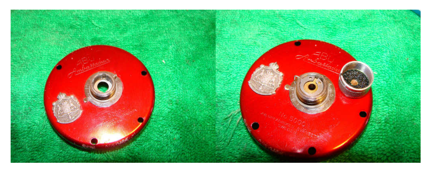
Replace the bottom circlip. Soak the bushing in oil and wipe of any excess and then replace it followed by the top circlip. Replace the shims in the spool cap (with a drop of oil), and then replace the felt washer. Apply oil to the felt washer and then replace the spool cap ensuring that the indicator wire fits properly into the slot.