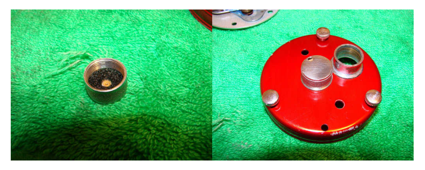
Replace the circlip in the right side plate followed by the bushing (soak in oil first and remove any excess). Replace the copper shims in the spool cap with a drop of oil. Replace the felt washer and saturate it with oil. Grease the threads for the spool cap and replace the spool cap ensuring that it is screwed in fully.