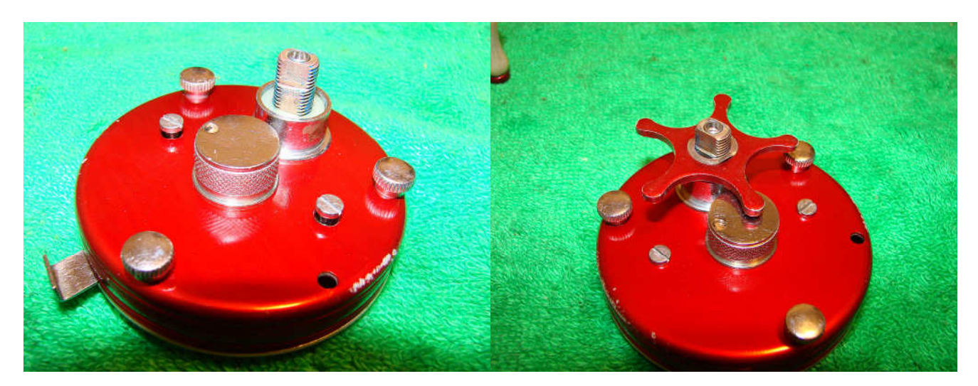
Replace the side plate on the brake plate. Grease the threads on the bridge screws and snug them down. Replace the star drag.