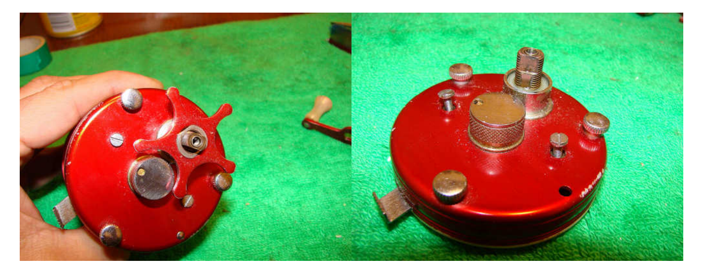
Remove the handle and star drag and then undo the three thumb nuts and remove the side plate from the frame. Undo the two bridge screws and remove the side plate from the brake plate.