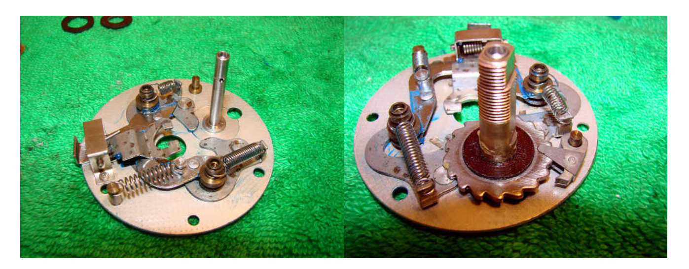
Apply a thin smear of grease to all of the friction surfaces (you can add a drop of oil to each stud that attaches the press arms to the brake plate). Smear liquid grease on the drive shaft post and then attach the drive shaft and anti reverse dog. Apply a thin smear of drag grease where the ears of the anti reverse dog grip. Apply a very light smear of drag grease to the base drag washer and the drive shaft where it contacts with the main gear.