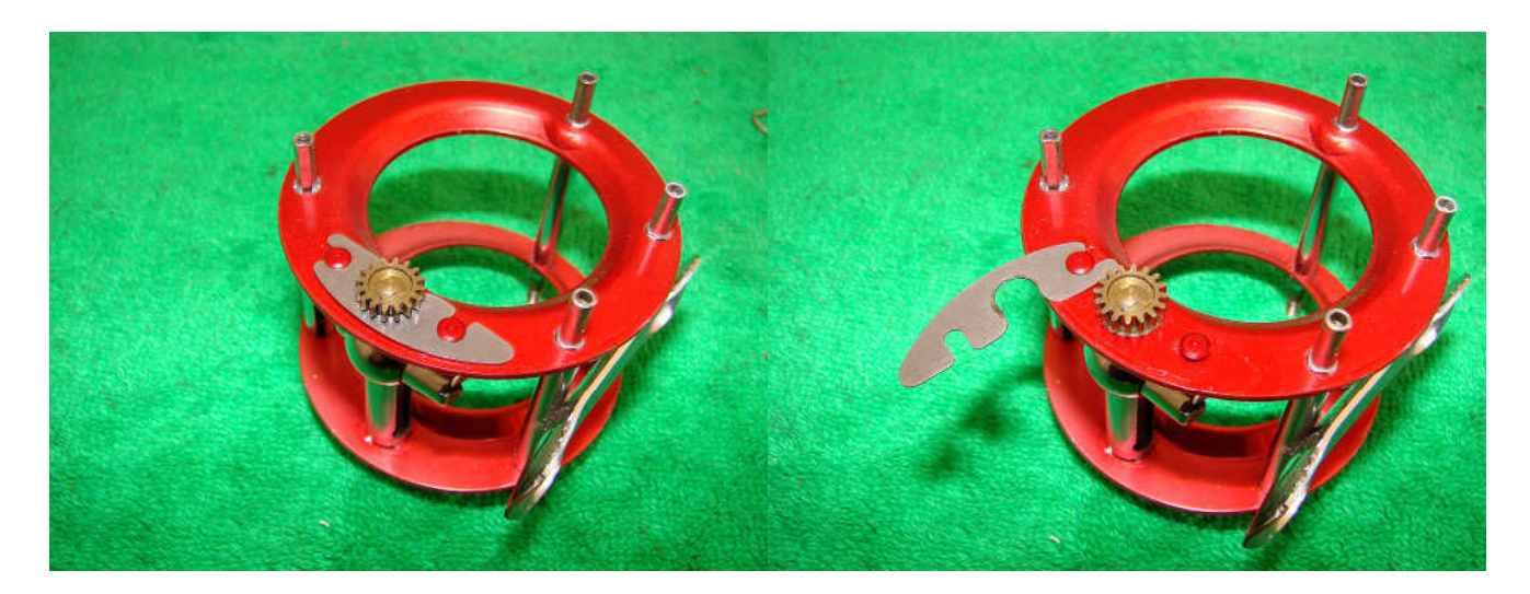
The carriage screw lock is on upside down here! Remove by sliding off.