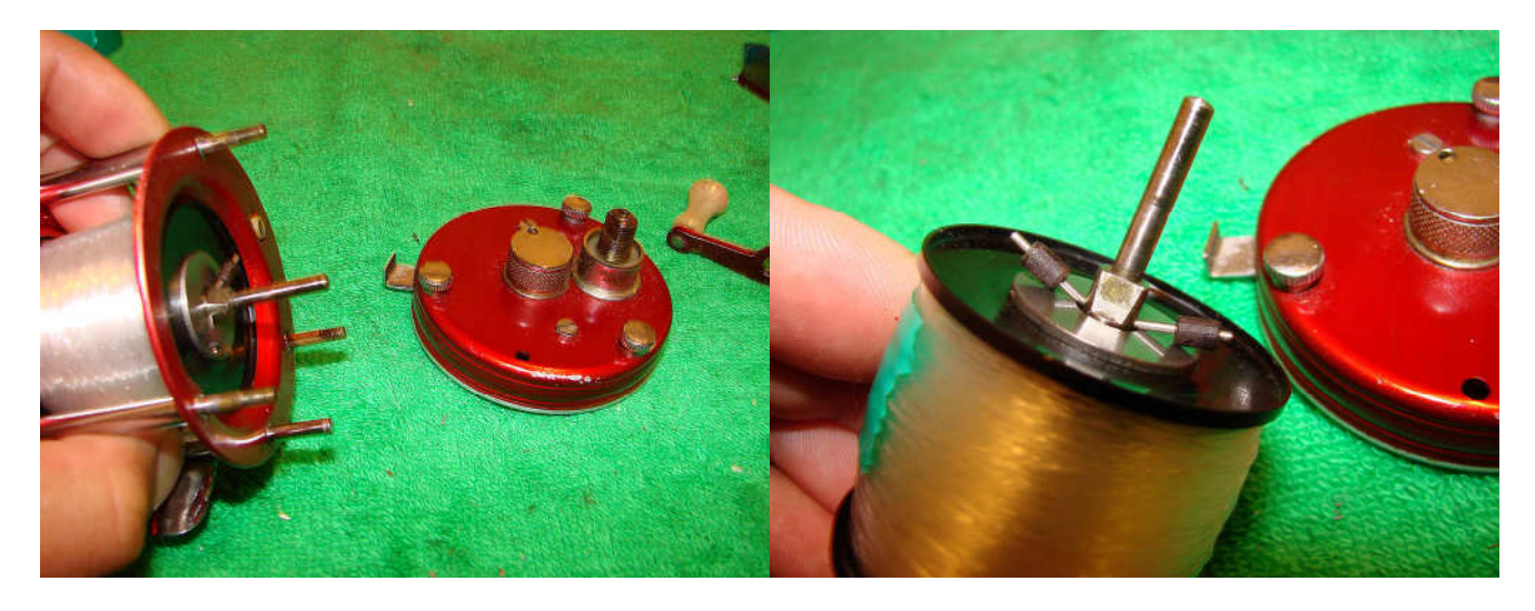
When I removed the right side plate the centrifugal brake pins looked bizarre-like they had been forced upwards.