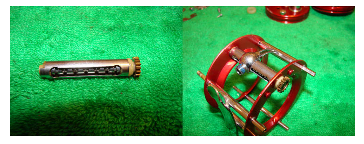
Add a drop of oil either side of the bushing on the carriage screw (near the gear) and one where it contacts with the plastic bushing in the cover. Place the assembly back in the frame. Grease the threads on the level wind.

Without the side plates maintaining rigidity this frame shows a bit of flex! Everything needs to be cleaned before reassembly. Washing up liquid, warm water and a toothbrush should get things clean (use lighter fluid for the bushings, centrifugal brakes and the drag washers). If there are stubborn grease and oil deposits you can use lighter fluid/shellite, though I wouldn't recommend using it on plastic parts. Make sure that you rinse and dry all parts thoroughly.