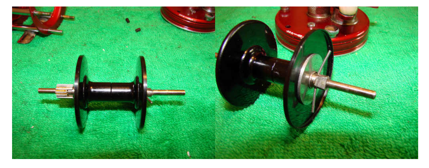
First thing is to rejoin the spool halves-this looks much better but the pins still need to be straightened.