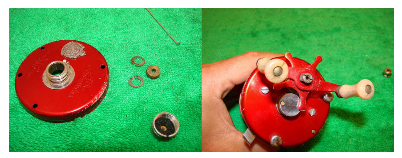
Remove the circlips and the bushing. The felt can be pried out of the spool cap with a tooth pick and the copper shims can be removed. Clean the felt washer by soaking in lighter fuel. Undo the handle nut and remove the screw.