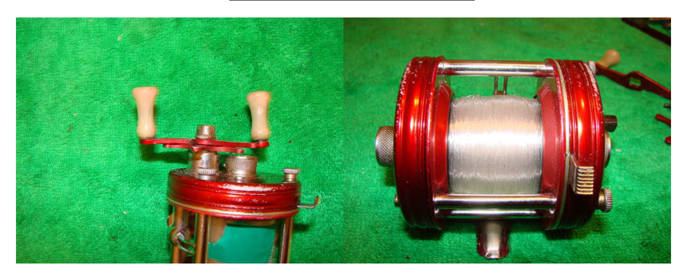
This four screw Ambassadeur 5000 seemed really rough when cranking. The bent handle was obvious but closer inspection showed that the spool didn't quite fit. This was really odd as the spool seemed to be slightly too wide for the frame. Initially I thought that the frame was bent as I also noticed a gap between the left side plate and frame. The colours of the two sideplates on the frame were different so I thought maybe the frame had been repaired at some stage and had been made too narrow by mistake.