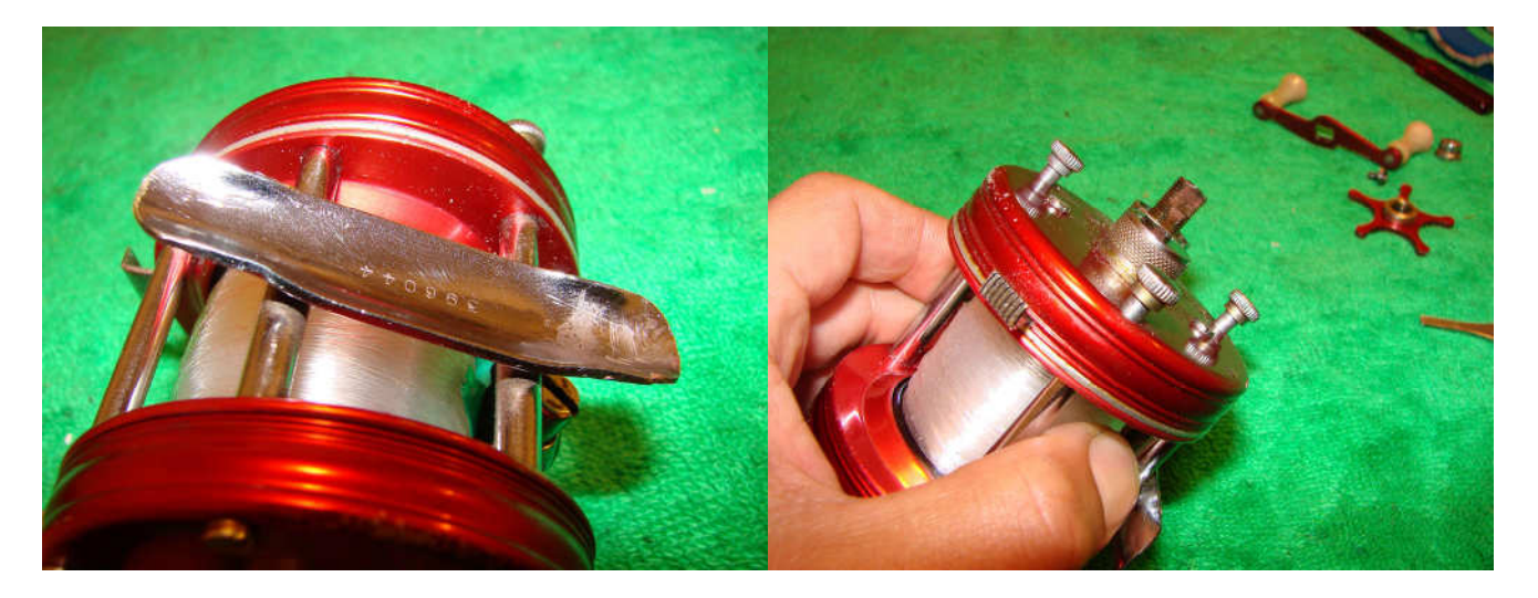
The reel foot looks to have been deliberately bent, possibly to fit a reel seat on a rod? Time to look inside to see what the problem is.