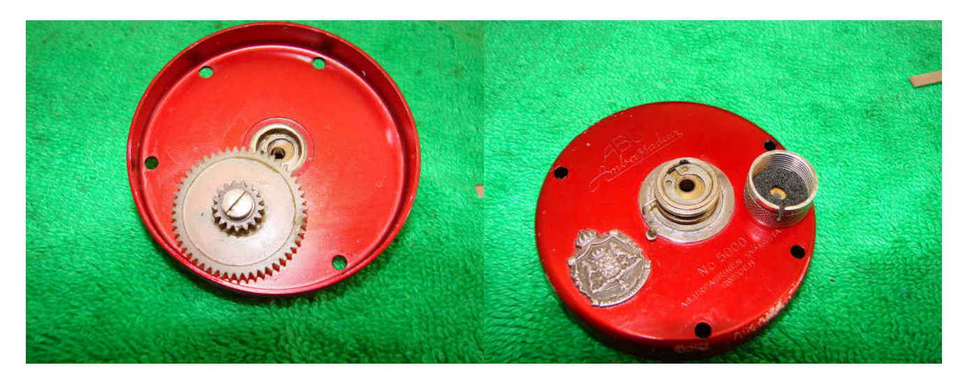
Remove the four pillar screws holding on the left side plate. Remove the idler gear screw and remove the idler gear. Turn the plate over and remove the spool cap.