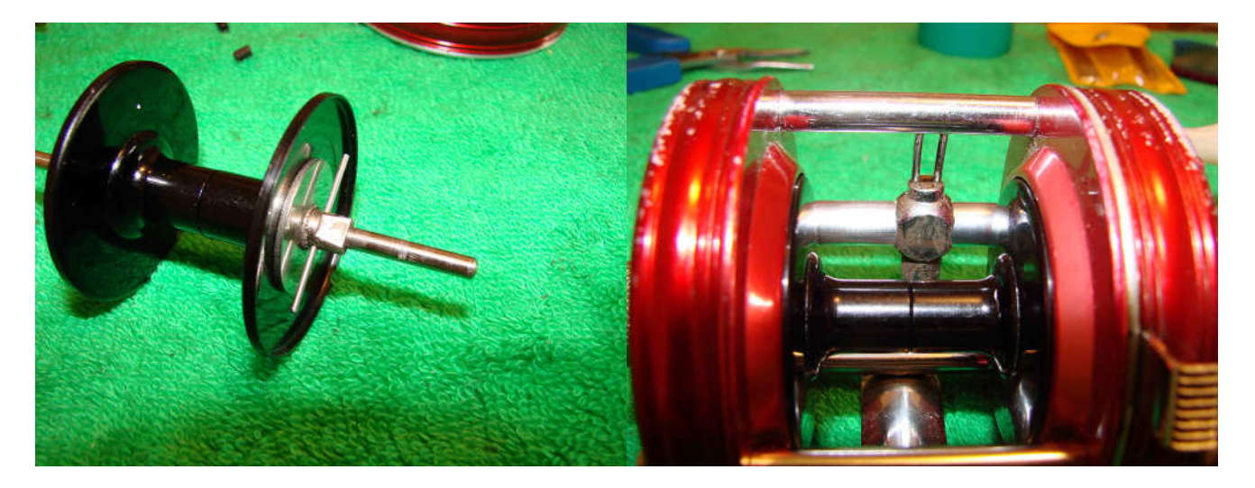
Pins all straightened. The spool is now a perfect fit in the frame and the centrifugal brakes work as they should. On with the rest of the service now that the spool has been fixed.