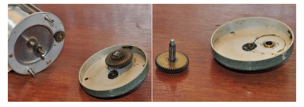
Remove the plate from the frame and remove the main gear from the side plate, it simply lifts out.