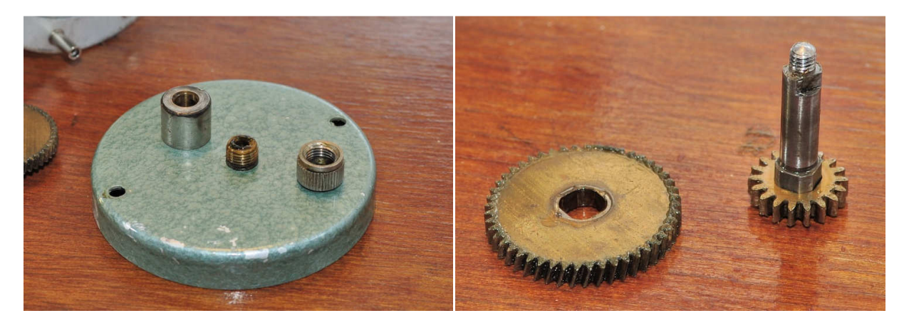
At this point you can remove the spool cap and add a drop of oil. The main gear separates from the shaft, the gear at the base of the shaft turns the level wind worm gear.