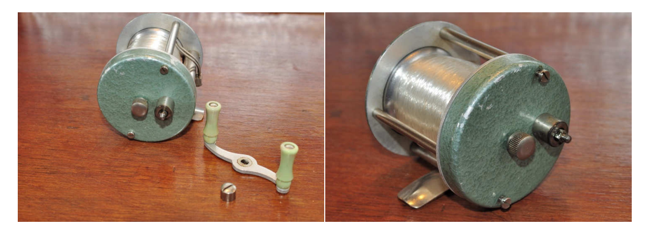
Undo the two pillar screws holding on the right side plate.