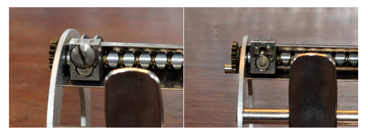
The level wind assembly comes apart in typical ABU fashion; undo the screw at the base of the line carriage and remove the pawl.