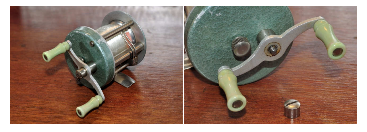
This is a very simple reel to service with very few moving parts. Start by removing the handle nut and handle.