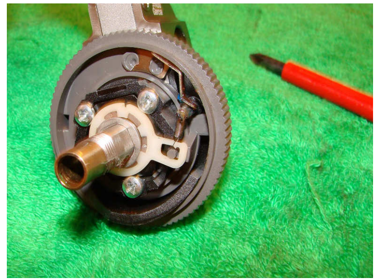
and replace the three screws to fix it in place.