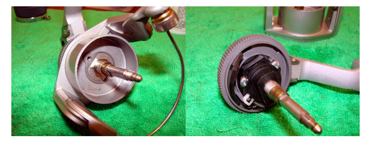
Undo the rotor nut and lift off the rotor.