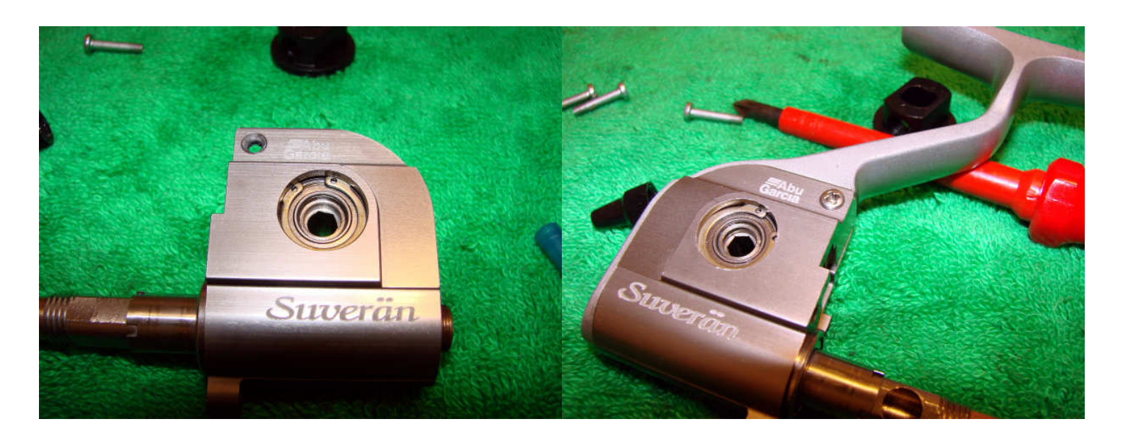
After cleaning and lubricating the bearings replace them in the gearbox and fix in place with the circlips. Replace the gearbox in the reel body and replace the two screws holding it in place.