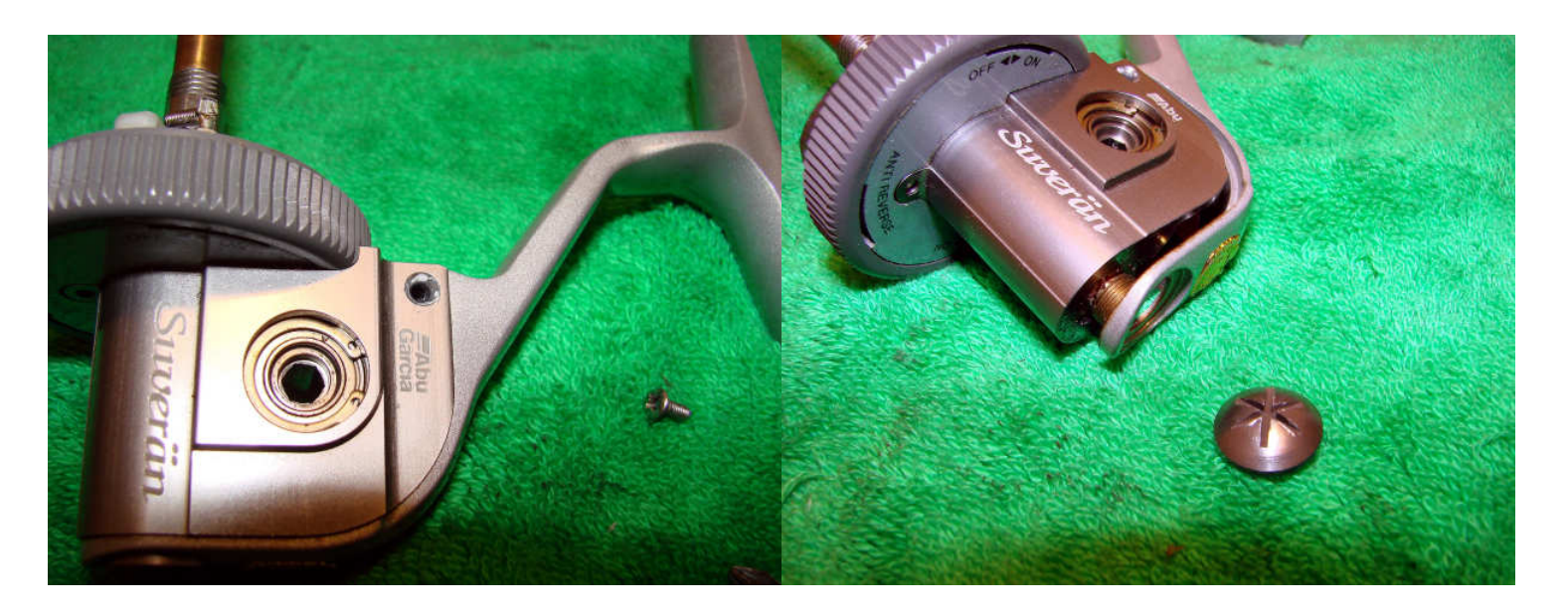
Undo the two screws holding the gearbox to the body (one either side) and then remove the screw securing the main shaft to the body.