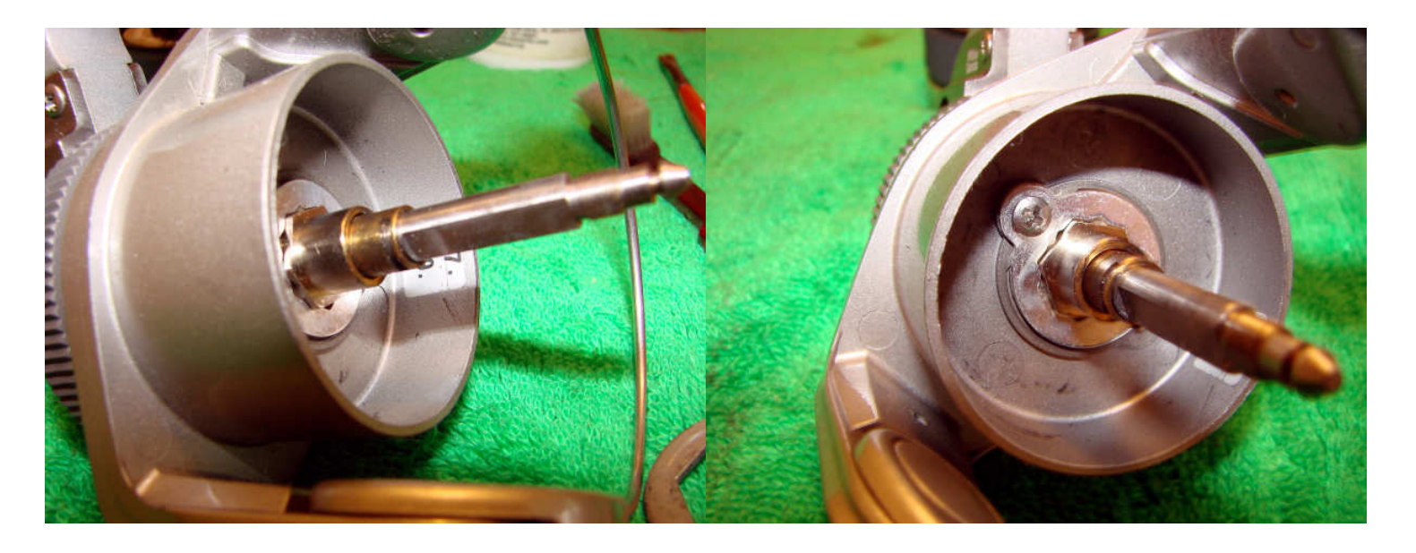
Note there is a rubber o-ring missing. Remove the rotor nut lock plate screw and the rotor nut lock plate.