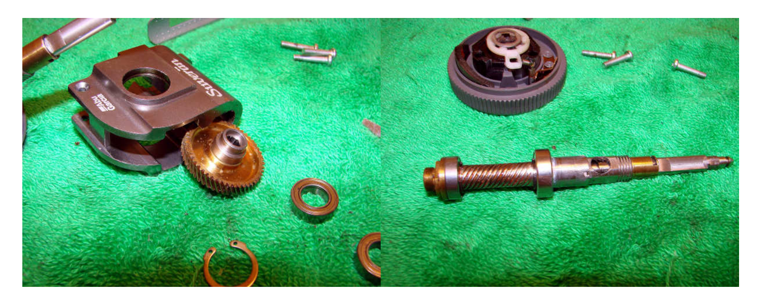
And then remove the bearings and main gear. The main shaft and pinion gear can then be removed.