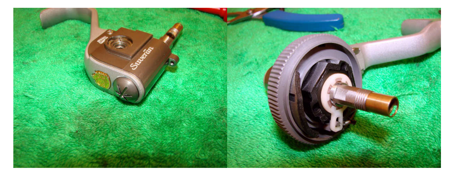
Grease the threads on the shaft nut and then replace. Replace the anti reverse assembly on the gearbox