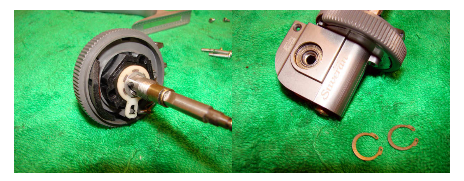
The reel body and the complete anti-reverse assembly can then be removed. Remove the bearing circlips.